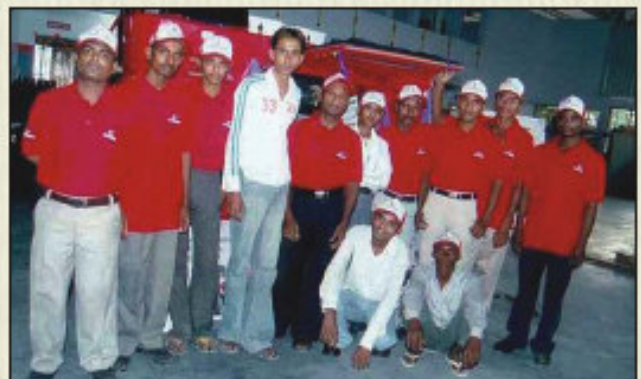
The Gimar Workshop Team